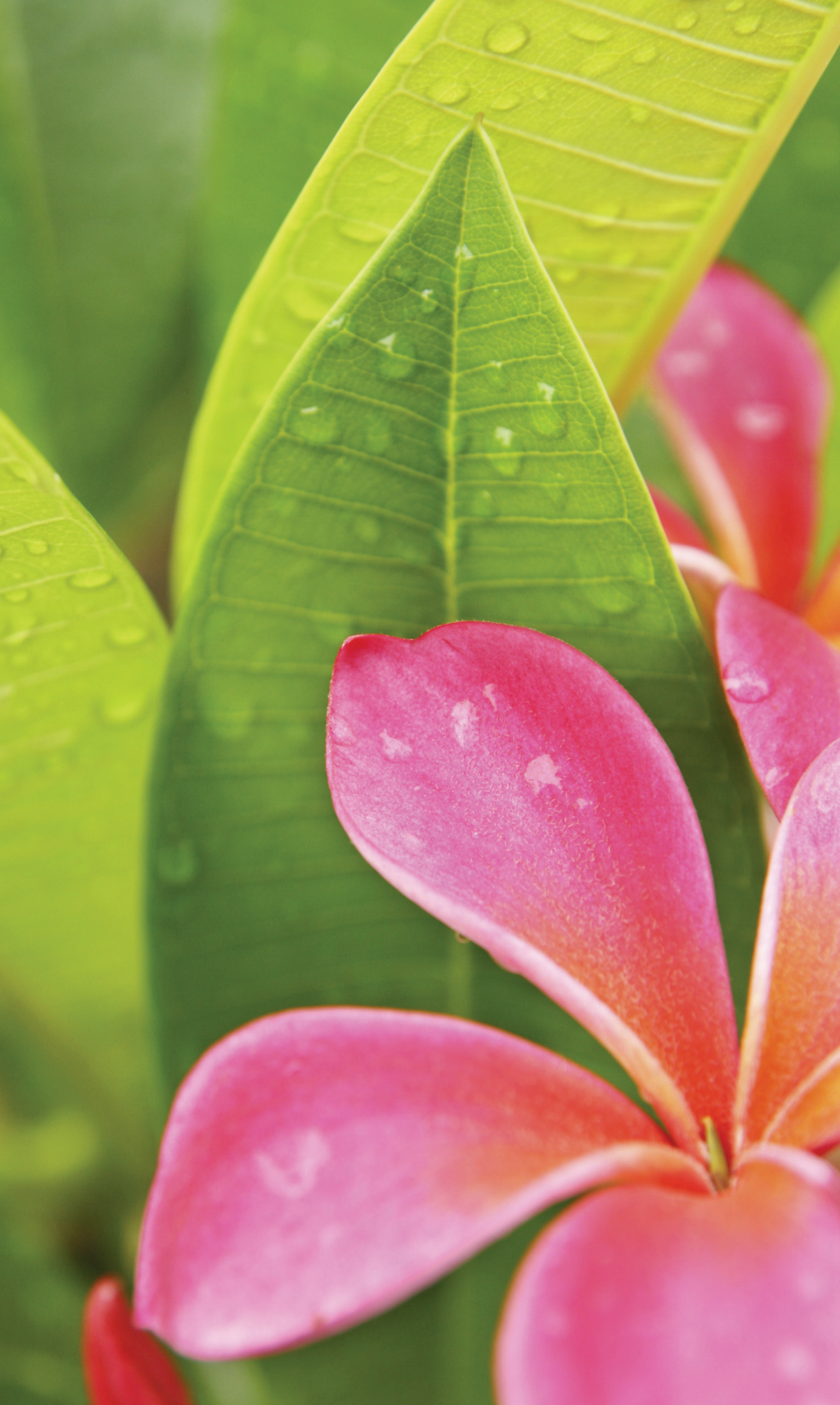
Grand Wailea, Maui, Hawaii